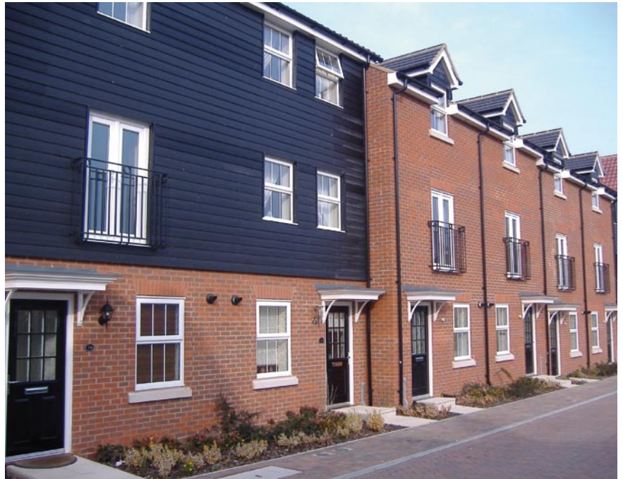
Affordable housing completions (new build) in 2007/8 % of all housing delivered and actual numbers completed

Councillor Susan Barker, Chair of EERA's Housing and Sustainable Communities Panel, said: "The delivery of new, affordable housing is one of the region's top priorities. With the average house price in the East of England costing nearly £230,000, key workers and first time buyers are finding it impossible to get onto the housing ladder. The supply of housing is difficult to predict in the long-term. The 'credit crunch' has resulted in a sharp decrease in new construction projects.